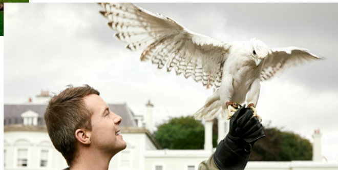
Falconry: falcons, hawks, owls and a magnificent golden eagle