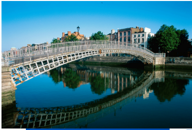
Ha'penny Bridge 800 meters away