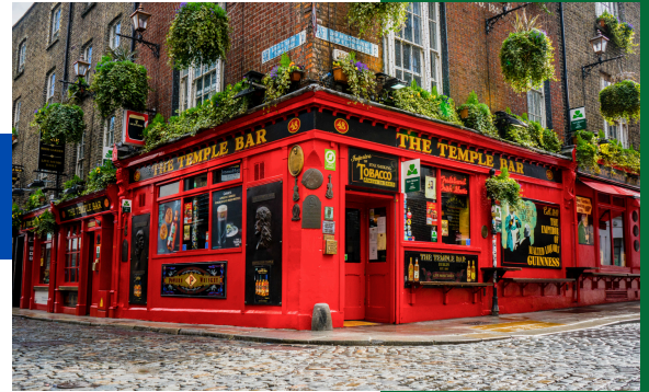
Temple Bar 1.3 km away

Dublin, a city brimming with history, culture, and hidden treasures, awaits your exploration. When you stay at the Conrad , you are in the heart of the city center overlooking The National Concert Hall . Explore wandering paths of St. Stephen's Green , adjacent to the hotel. Experience luxury shopping on Grafton Street . Discover Dublin's unique character with distillery visits such as the Guinness Storehouse , scenic tours, and experiences curated by our concierges.