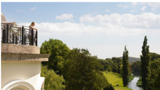
The K Club Balcony, Ireland