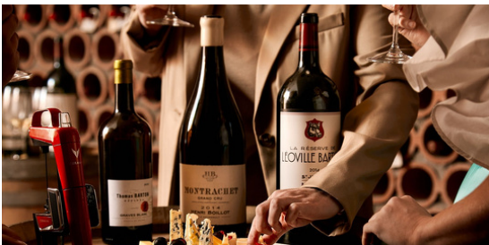
Barton and Bespoke Wine Tasting

While at The K Club, why not make the most of your stay and enjoy the wide range of activities we have to offer at this historical 550-acre estate? Established in 1832, The K Club invites guests to experience the good life through a rich array of timeless pursuits and indulgent activities. From fishing on the River Liffey to horse riding through the Kildare countryside, boat trips, paddle boarding, archery, wine tour, whiskey tasting, various spa experiences... we have a whole host of activities to suit all of our guests.