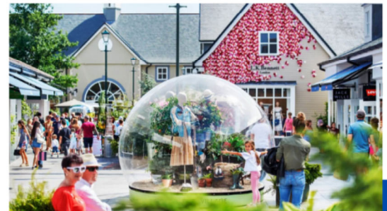
Kildare Village Shopping, Ireland