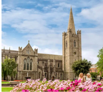
St. Patrick's Cathedral 1 km away